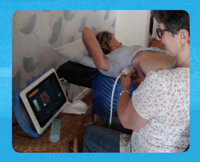
Photo above: The FibroScan probe is placed on your skin where the liver is located. The probe generates a pulse, which sends waves to the liver, measuring liver stiffness.

Please contact your GP If you have any questions about the FibroScan or your results.